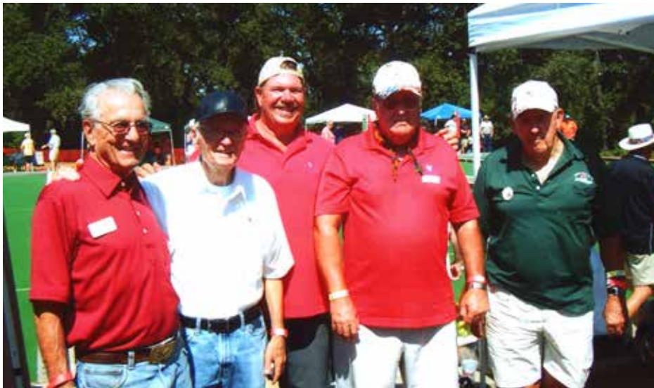
2013 Branch 79 Bocce Ball Team, Penn Valley