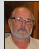
BIG SIR Don Bull